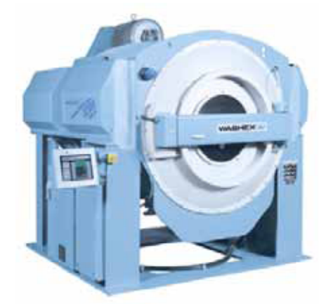
Large open pocket, end-loading washer/ extractor

Air-quality concerns are causing the commercial drycleaning industry to change technologies and processes.