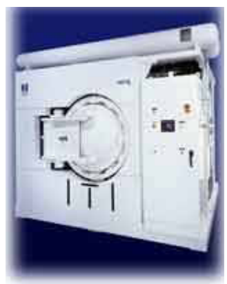
Dry cleaning machine