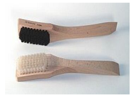
Three brushes are needed